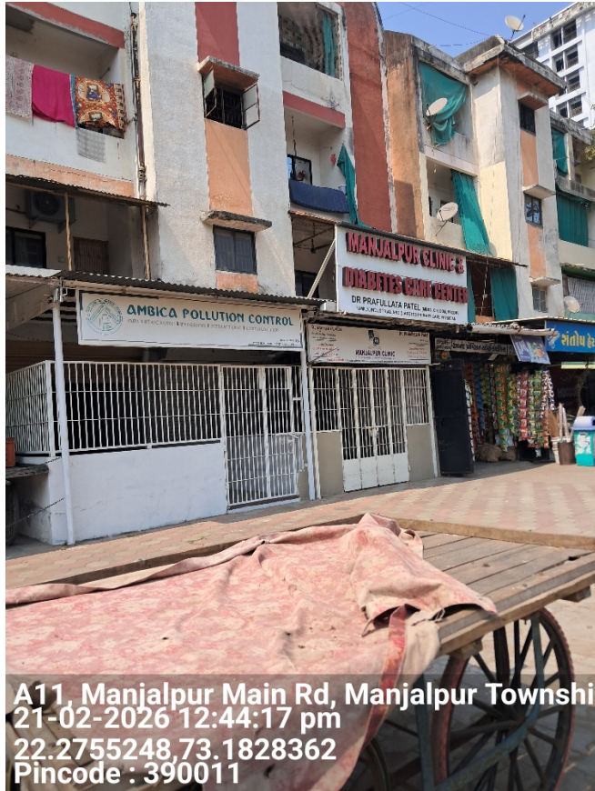
A11, Manjalpur Main Rd, Manjalpur Townshi 21-02-2026 12:44:17 pm 22.2755248,73.1828362 Pincode : 390011

Shop inside with inventory photos establishing that the inside is of the same shop where the front photo was taken