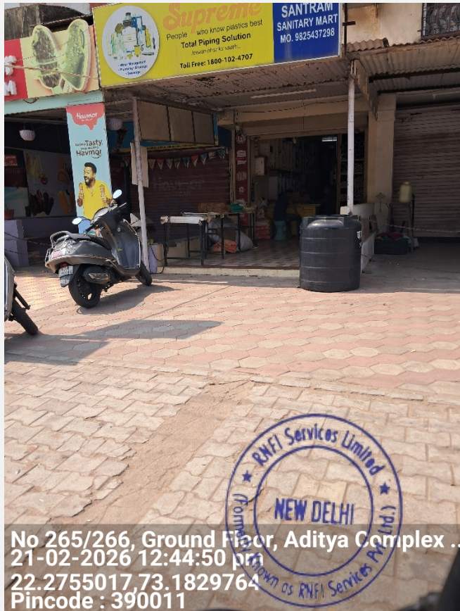
No 265/266, Ground Floor, Aditya Complex .. 21-02-2026 12:44:50 pm 22.2755017,73.1829764 Pincode : 390011