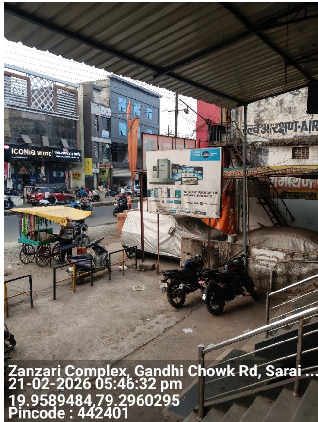
Zanzari Complex, Gandhi Chowk Rd, Sarai ... 21-02-2026 05:46:32 pm 19.9589484,79.2960295 Pincode : 442401

Shop inside with inventory photos establishing that the inside is of the same shop where the front photo was taken