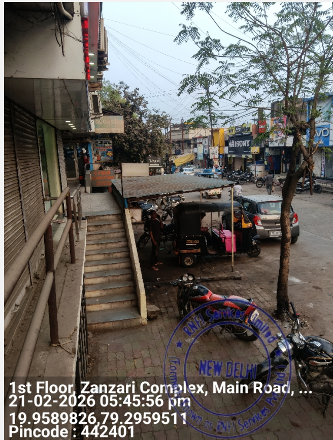
1st Floor, Zanzari Complex, Main Road, ... 21-02-2026 05:45:56 pm 19.9589826,79.2959511 Pincode : 442401