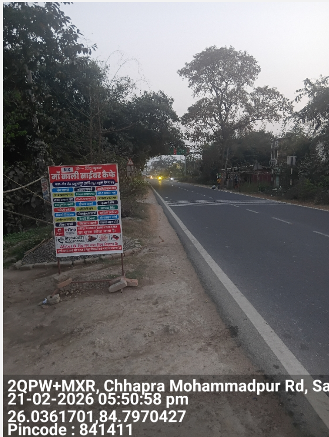
2QPW+MXR, Chhapra Mohammadpur Rd, Sa 21-02-2026 05:50:58 pm 26.0361701,84.7970427 Pincode : 841411

Take Photo of Person Met Inside the Shop