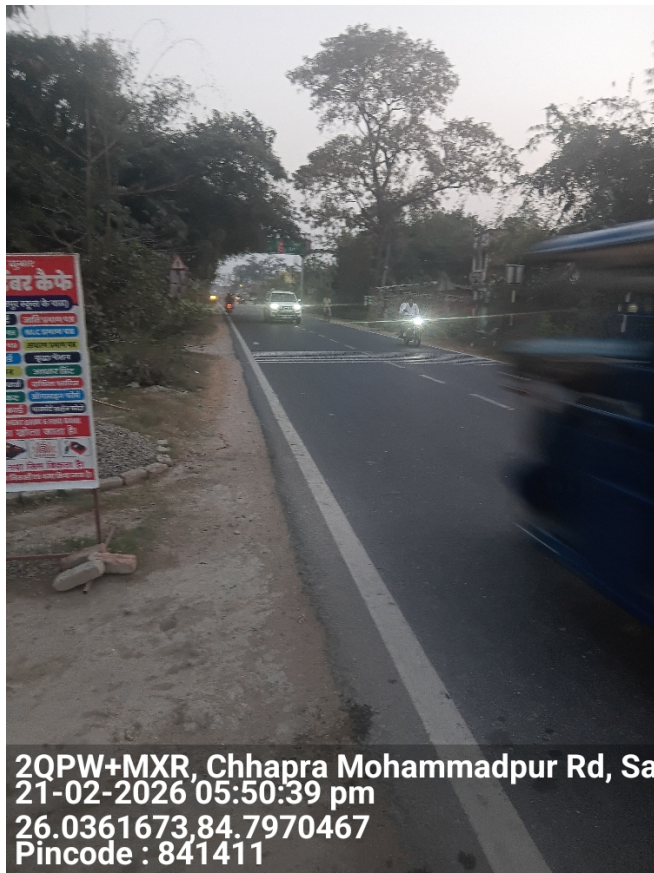
2QPW+MXR, Chhapra Mohammadpur Rd, Sa 21-02-2026 05:50:39 pm 26.0361673,84.7970467 Pincode : 841411

Shop front photo with full vertical viewpoint i.e; shop board, sealing, entrance, ground on which the shop is established (cemented, pilers, bricks, stands, mud, wheels etc.)