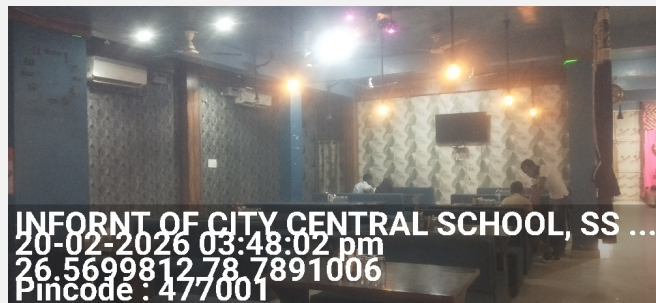
INFORNT OF CITY CENTRAL SCHOOL, SS ... 20-02-2026 03:48:02 pm 26.5699812,78.7891006 Pincode : 477001

Shop inside with inventory photos establishing that the inside is of the same shop where the front photo was taken