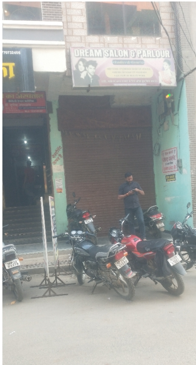
INFORNT OF CITY CENTRAL SCHOOL, SS .. 20-02-2026 03:47:20 pm 26.5699894,78.7890621 Pincode : 477001

Shop front with horizontal view covering the left & right of the shop establishing if the shop is an individual structure, in a marketplace, highway, isolated place, in a cluster framework.