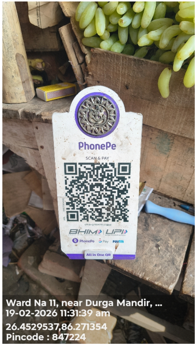
Photo with UPI Scanner