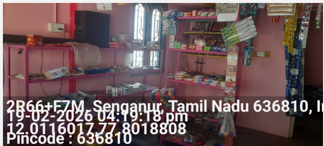
Photo of Stock