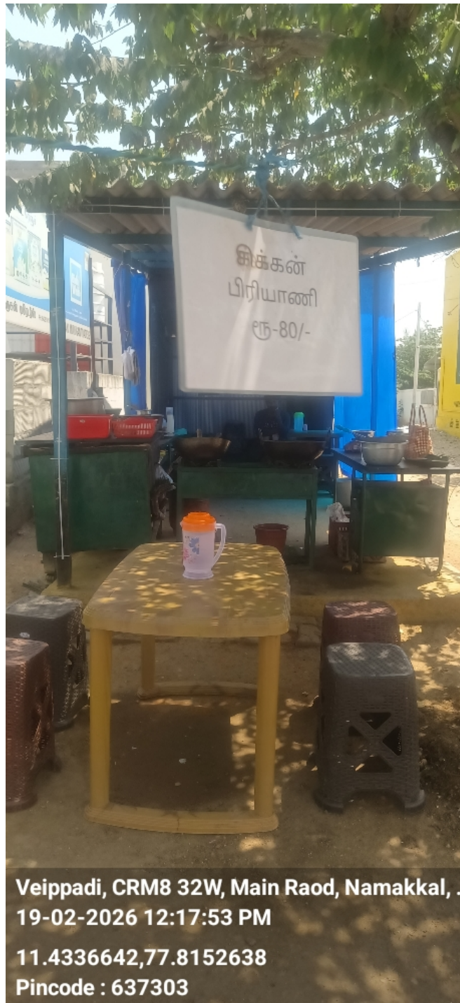
Veippadi, CRM8 32W, Main Raod, Namakkal, . 19-02-2026 12:17:53 PM 11.4336642,77.8152638 Pincode : 637303

Shop front with horizontal view covering the left & right of the shop establishing if the shop is an individual structure, in a marketplace, highway, isolated place, in a cluster framework.