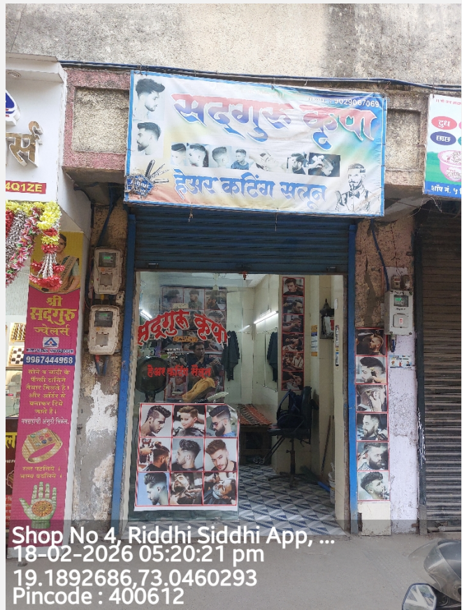
Shop No 4, Riddhi Siddhi App, ... 18-02-2026 05:20:21 pm 19.1892686,73.0460293 Pincode : 400612

Shop front photo with full vertical viewpoint i.e; shop board, sealing, entrance, ground on which the shop is established (cemented, pilers, bricks, stands, mud, wheels etc.)