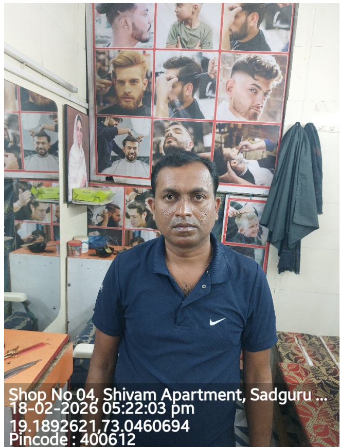
Shop No 04, Shivam Apartment, Sadguru ... 18-02-2026 05:22:03 pm 19.1892621,73.0460694 Pincode : 400612

Take Photo of Person Met Inside the Shop