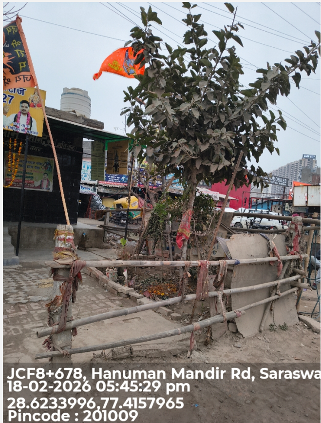
JCF8+678, Hanuman Mandir Rd, Saraswa 18-02-2026 05:45:29 pm 28.6233996,77.4157965 Pincode : 201009

Shop inside with inventory photos establishing that the inside is of the same shop where the front photo was taken