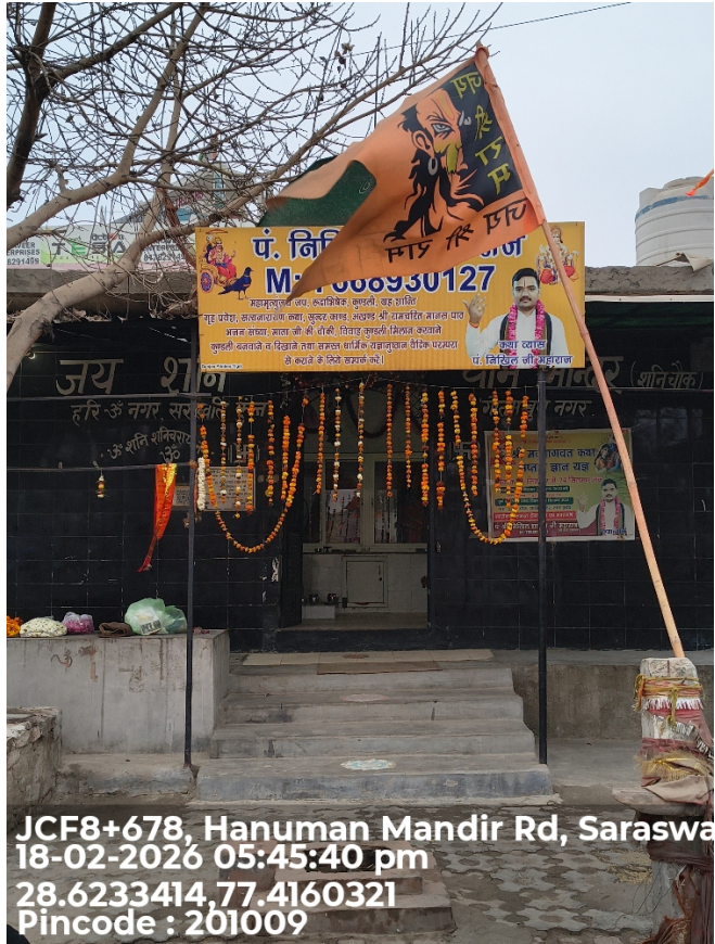
JCF8+678, Hanuman Mandir Rd, Saraswa 18-02-2026 05:45:40 pm 28.6233414,77.4160321 Pincode : 201009

Shop front with horizontal view covering the left & right of the shop establishing if the shop is an individual structure, in a marketplace, highway, isolated place, in a cluster framework.