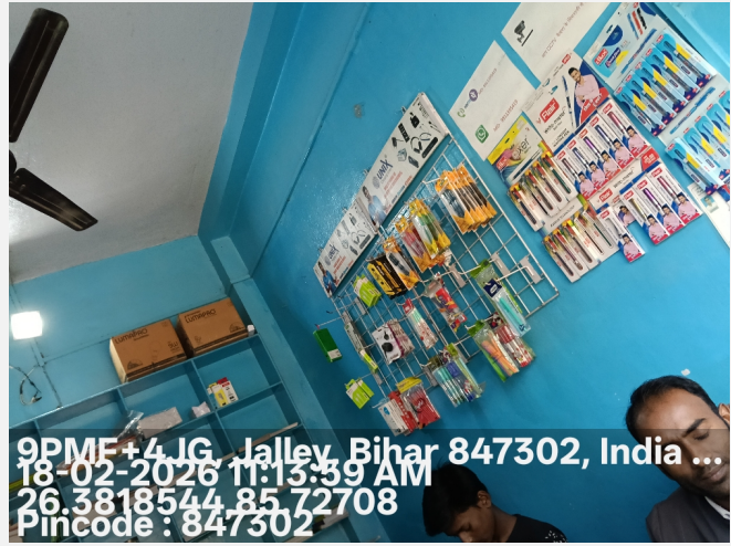
Photo of Stock