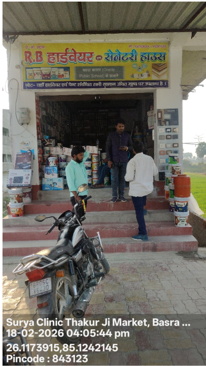
Surya Clinic Thakur Ji Market, Basra ... 18-02-2026 04:05:44 pm 26.1173915,85.1242145 Pincode : 843123