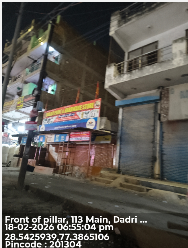
Front of pillar, 113 Main, Dadri ... 18-02-2026 06:55:04 pm 28.5425939,77.3865106 Pincode : 201304

Shop inside with inventory photos establishing that the inside is of the same shop where the front photo was taken