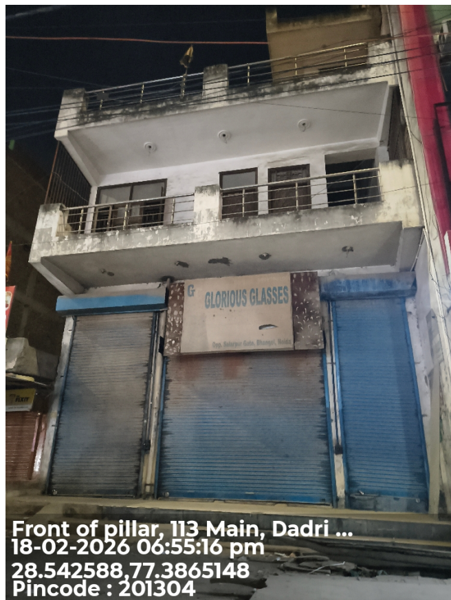
Front of pillar, 113 Main, Dadri ... 18-02-2026 06:55:16 pm 28.542588,77.3865148 Pincode : 201304

Shop front with horizontal view covering the left & right of the shop establishing if the shop is an individual structure, in a marketplace, highway, isolated place, in a cluster framework.