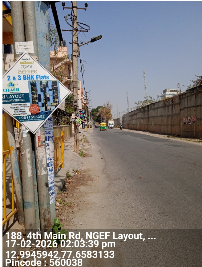
188, 4th Main Rd, NGEF Layout, ... 17-02-2026 02:03:39 pm 12.9945942,77.6583133 Pincode : 560038

Shop inside with inventory photos establishing that the inside is of the same shop where the front photo was taken