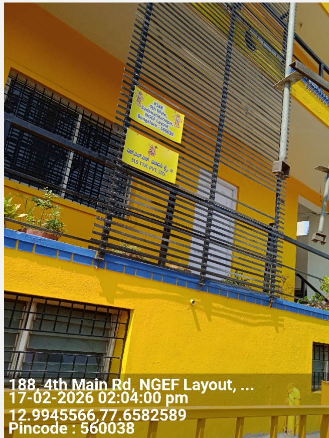
188, 4th Main Rd, NGEF Layout, ... 17-02-2026 02:04:00 pm 12.9945566,77.6582589 Pincode : 560038

Shop front with horizontal view covering the left & right of the shop establishing if the shop is an individual structure, in a marketplace, highway, isolated place, in a cluster framework.