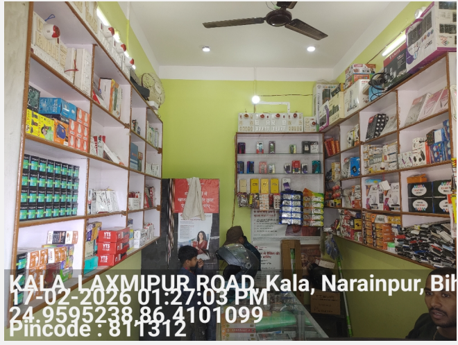
Photo of Stock