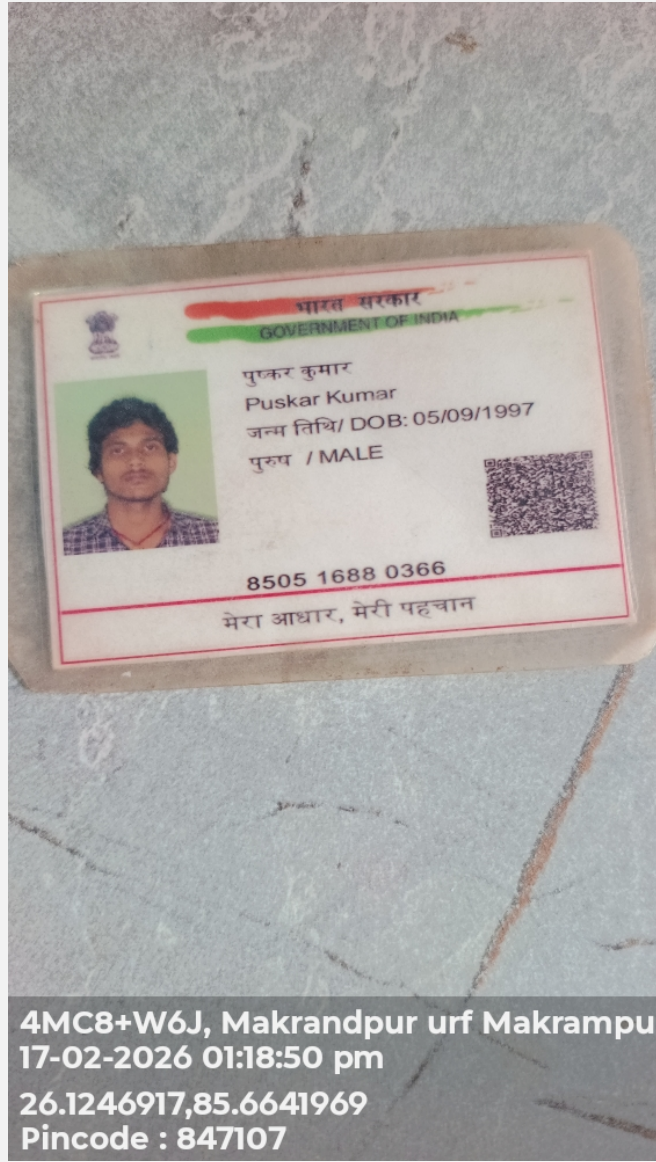
Photo of ID Proof