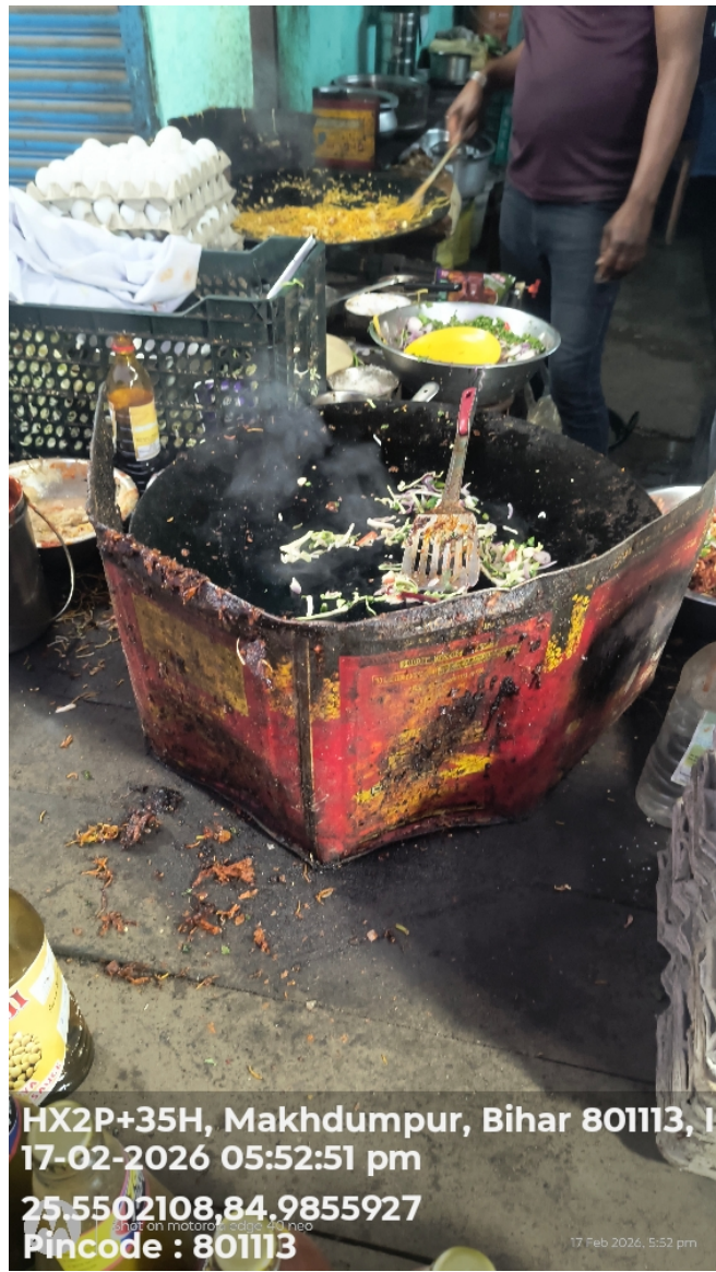
Photo of Machinery Setup