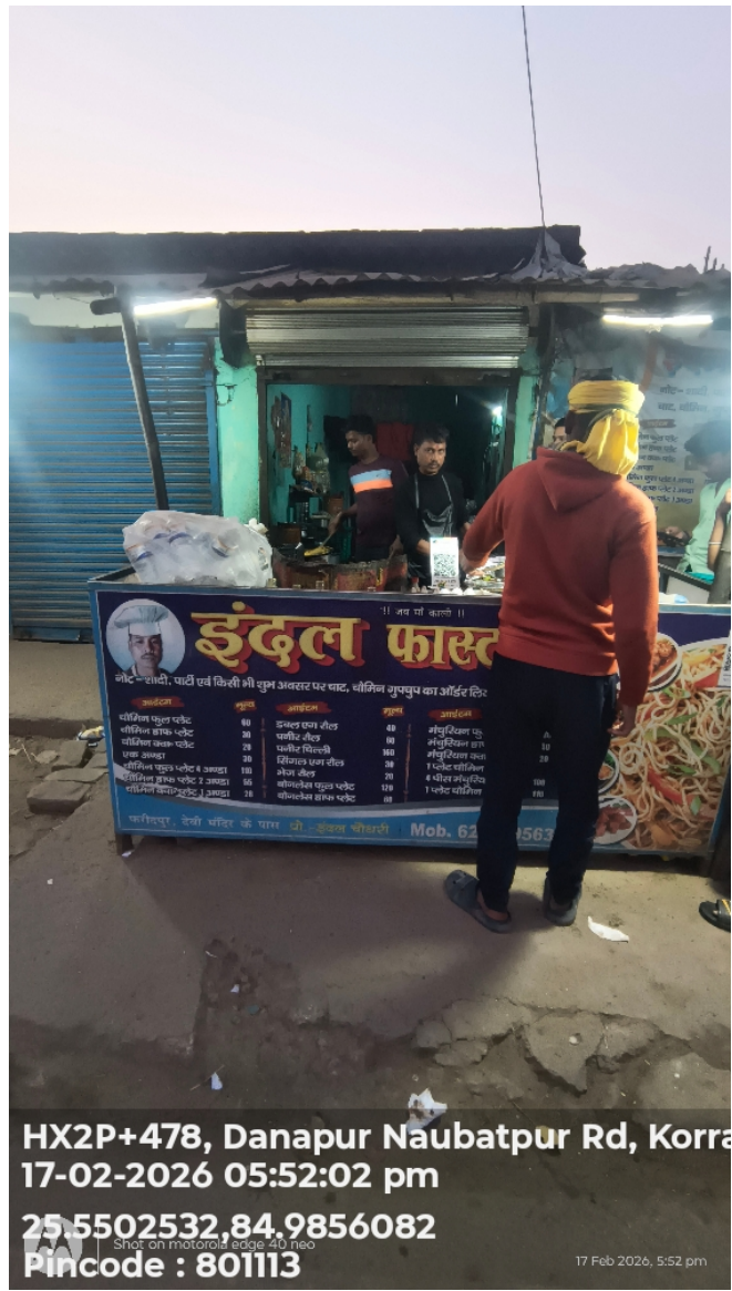
Shop Photo with Business Board