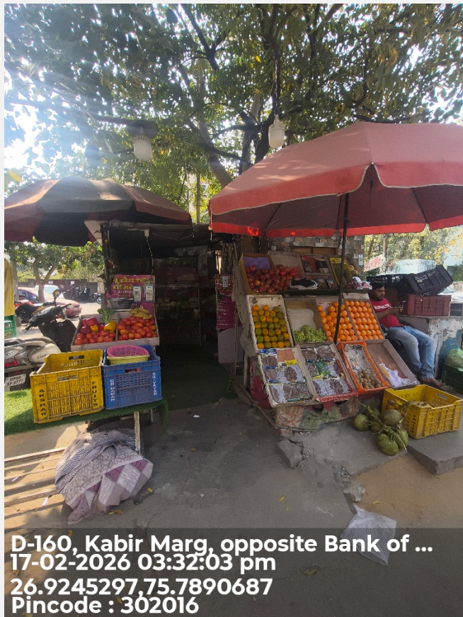
D-160, Kabir Marg, opposite Bank of ... 17-02-2026 03:32:03 pm 26.9245297,75.7890687 Pincode : 302016

Shop front with horizontal view covering the left & right of the shop establishing if the shop is an individual structure, in a marketplace, highway, isolated place, in a cluster framework.