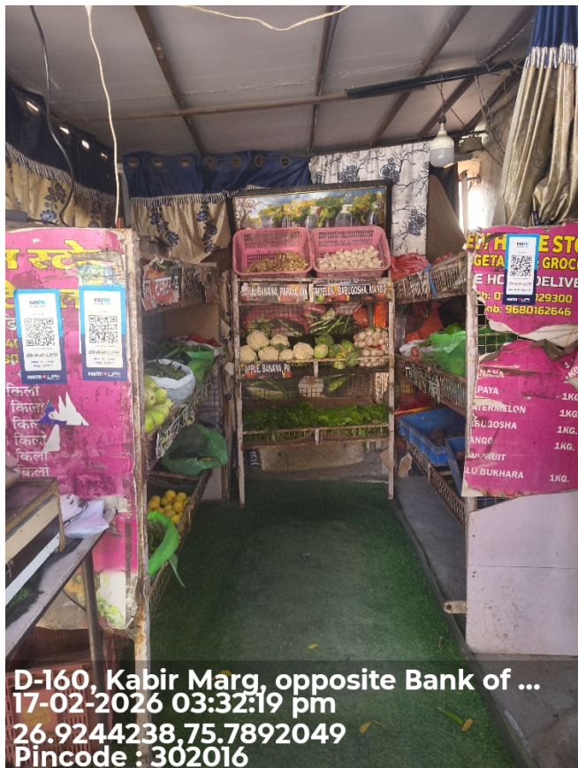
D-160, Kabir Marg, opposite Bank of ... 17-02-2026 03:32:19 pm 26.9244238,75.7892049 Pincode : 302016

Shop inside with inventory photos establishing that the inside is of the same shop where the front photo was taken