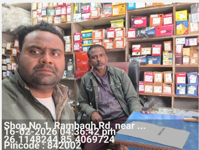
Photo with Agent