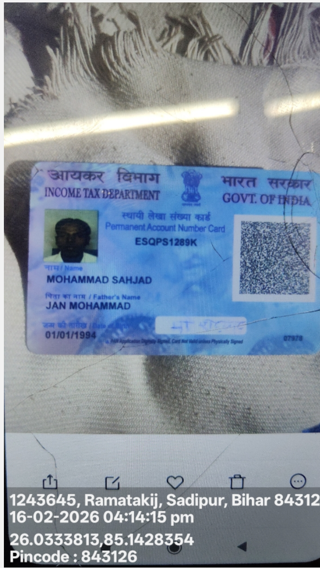
Photo of ID Proof