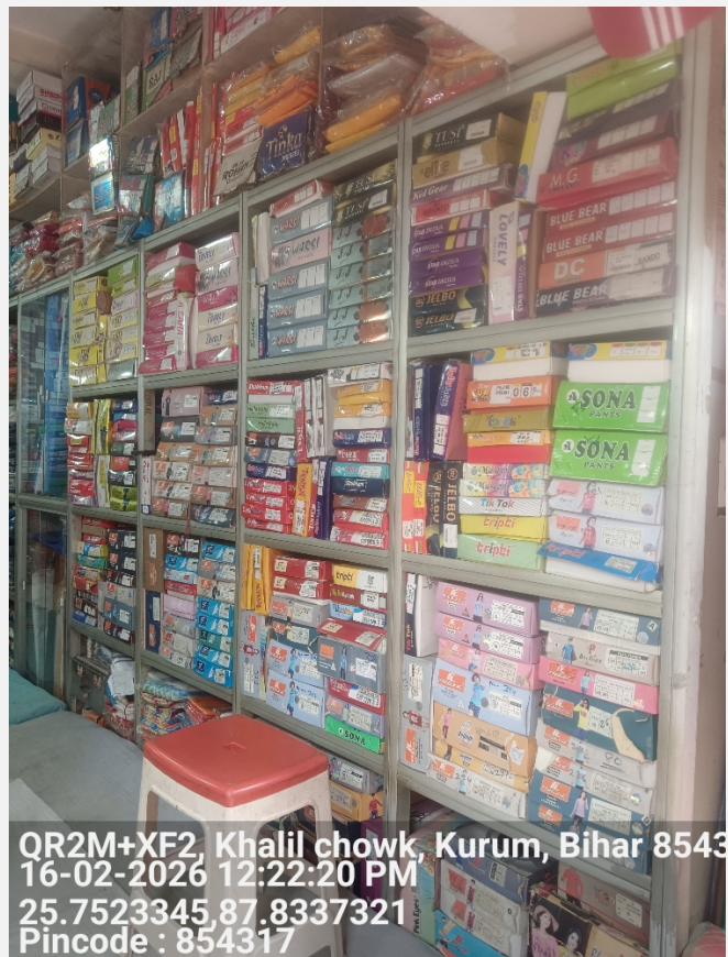
Photo of Stock