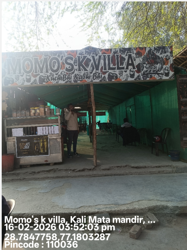
Momo's k villa, Kali Mata mandir, ... 16-02-2026 03:52:03 pm 28.7847758,77.1803287 Pincode : 110036

Shop front photo with full vertical viewpoint i.e; shop board, sealing, entrance, ground on which the shop is established (cemented, pilers, bricks, stands, mud, wheels etc.)