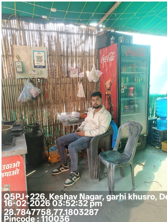
Q5PJ+226, Keshav Nagar, garhi khusro, De 16-02-2026 03:52:32 pm 28.7847758,77.1803287 Pincode : 110036

Take Photo of Person Met Inside the Shop