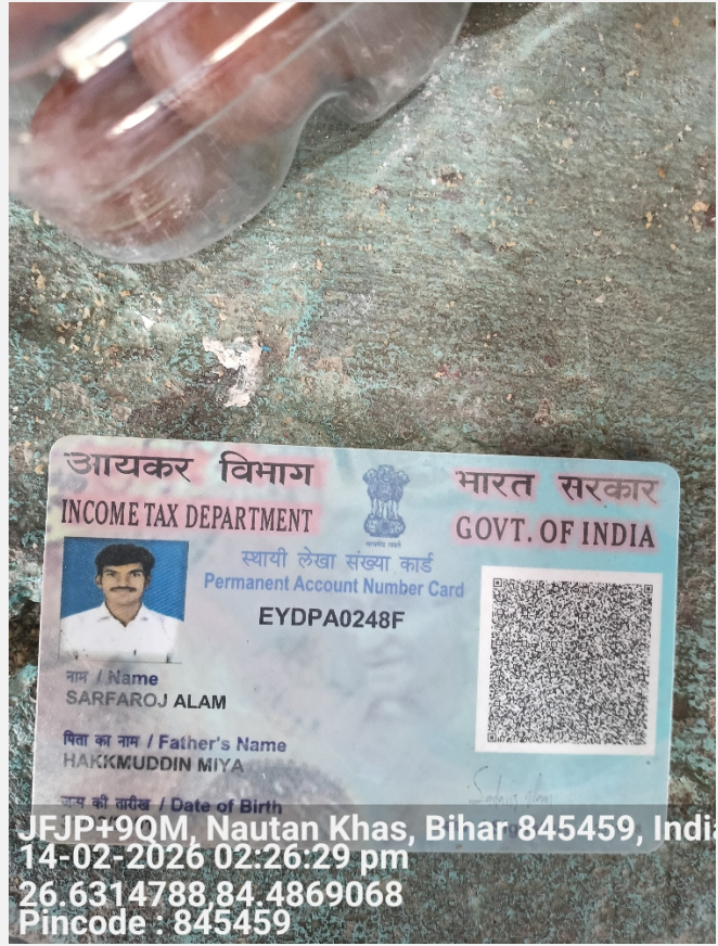
Photo of ID Proof