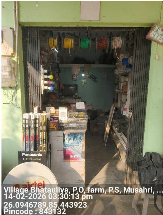
Shop Photo Outside