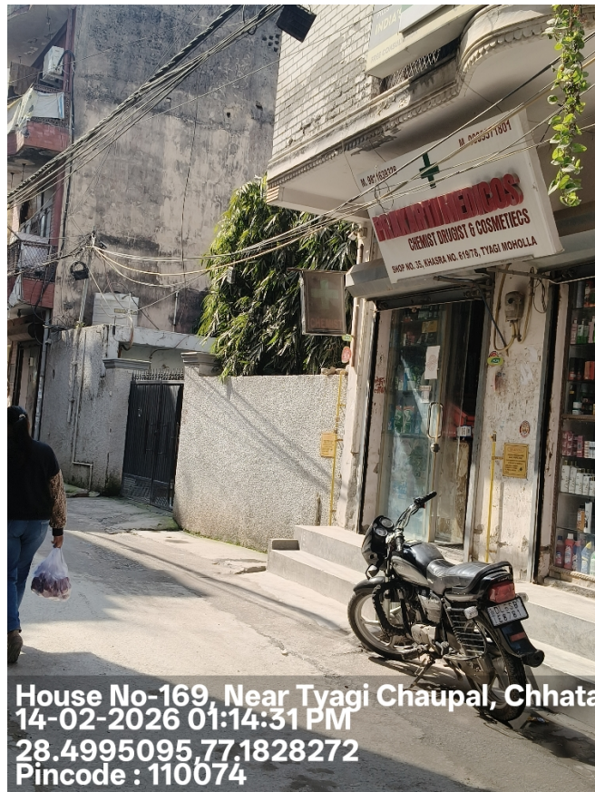
House No-169, Near Tyagi Chaupal, Chhatarpur 14-02-2026 01:14:31 PM 28.4995095,77.1828272 Pincode : 110074

Shop front photo with full vertical viewpoint i.e; shop board, sealing, entrance, ground on which the shop is established (cemented, pilers, bricks, stands, mud, wheels etc.)