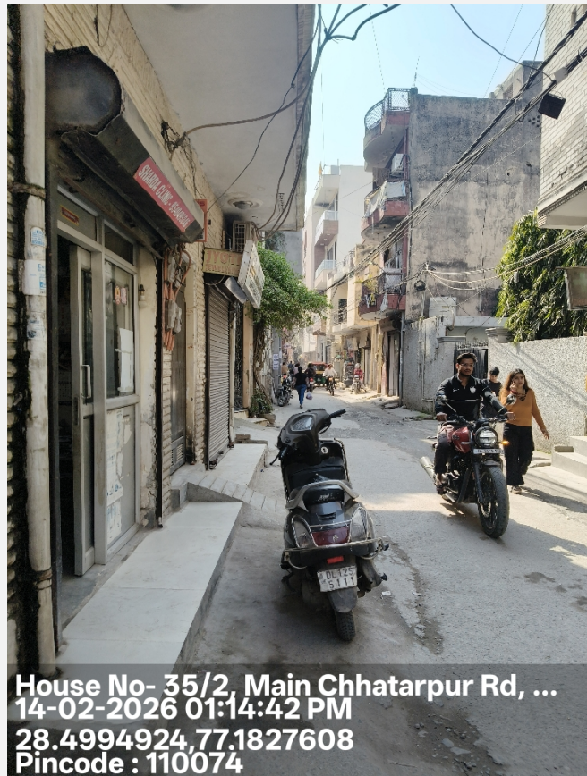
House No- 35/2, Main Chhatarpur Rd, ... 14-02-2026 01:14:42 PM 28.4994924,77.1827608 Pincode : 110074

Take Photo of Person Met Inside the Shop