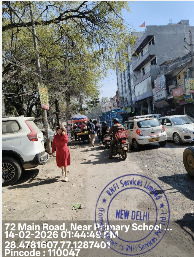
72 Main Road, Near Primary School ... 14-02-2026 01:44:49 PM 28.4781607,77.1287401 Pincode : 110047