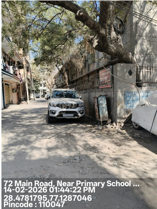
72 Main Road, Near Primary School ... 14-02-2026 01:44:22 PM 28.4781795,77.1287046 Pincode : 110047

Shop inside with inventory photos establishing that the inside is of the same shop where the front photo was taken