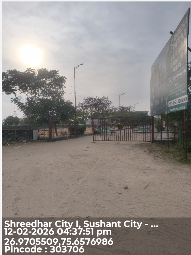
Shreedhar City I, Sushant City - ... 12-02-2026 04:37:51 pm 26.9705509,75.6576986 Pincode : 303706

Shop front with horizontal view covering the left & right of the shop establishing if the shop is an individual structure, in a marketplace, highway, isolated place, in a cluster framework.