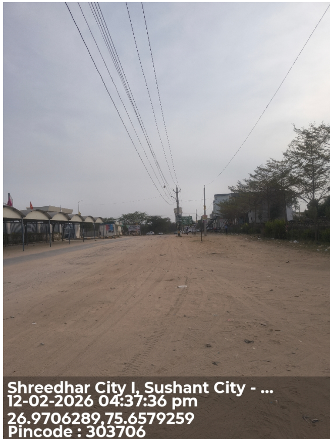
Shreedhar City I, Sushant City - ... 12-02-2026 04:37:36 pm 26.9706289,75.6579259 Pincode : 303706

Shop inside with inventory photos establishing that the inside is of the same shop where the front photo was taken