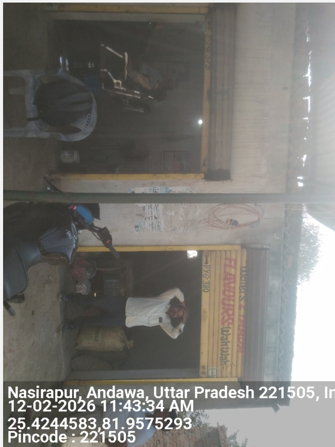
Nasirapur, Andawa, Uttar Pradesh 221505, In 12-02-2026 11:43:34 AM 25.4244583,81.9575293 Pincode : 221505

Shop front with horizontal view covering the left & right of the shop establishing if the shop is an individual structure, in a marketplace, highway, isolated place, in a cluster framework.