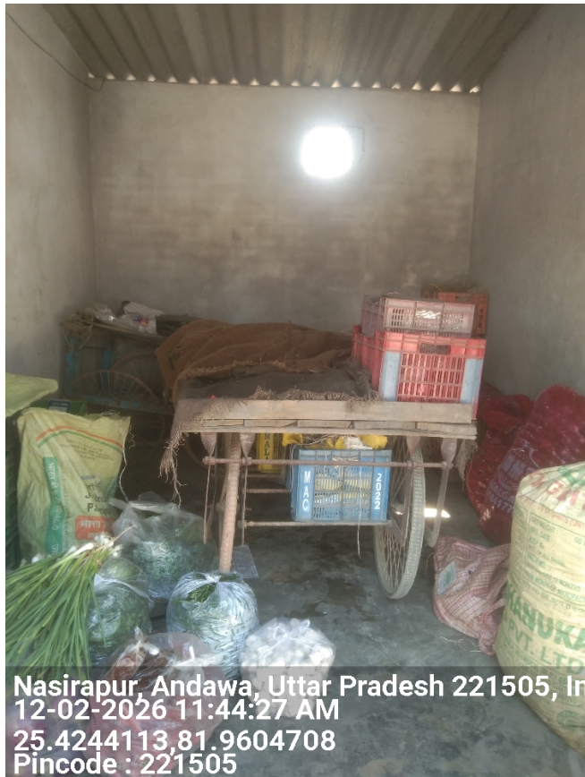
Nasirapur, Andawa, Uttar Pradesh 221505, In 12-02-2026 11:44:27 AM 25.4244113,81.9604708 Pincode : 221505

Shop inside with inventory photos establishing that the inside is of the same shop where the front photo was taken