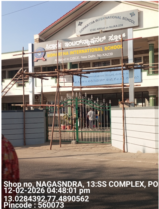
Shop no, NAGASNDRA, 13:SS COMPLEX, PO 12-02-2026 04:48:01 pm 13.0284392,77.4890562 Pincode : 560073

Shop inside with inventory photos establishing that the inside is of the same shop where the front photo was taken