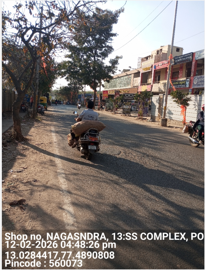
Shop no, NAGASNDRA, 13:SS COMPLEX, PO 12-02-2026 04:48:26 pm 13.0284417,77.4890808 Pincode : 560073

Shop front with horizontal view covering the left & right of the shop establishing if the shop is an individual structure, in a marketplace, highway, isolated place, in a cluster framework.