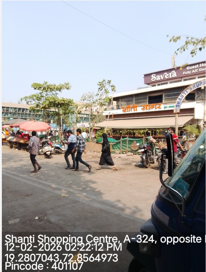
Shanti Shopping Centre, A-324, opposite 12-02-2026 02:22:12 PM 19.2807043, 72.8564973 Pincode : 401107

Shop front with horizontal view covering the left & right of the shop establishing if the shop is an individual structure, in a marketplace, highway, isolated place, in a cluster framework.