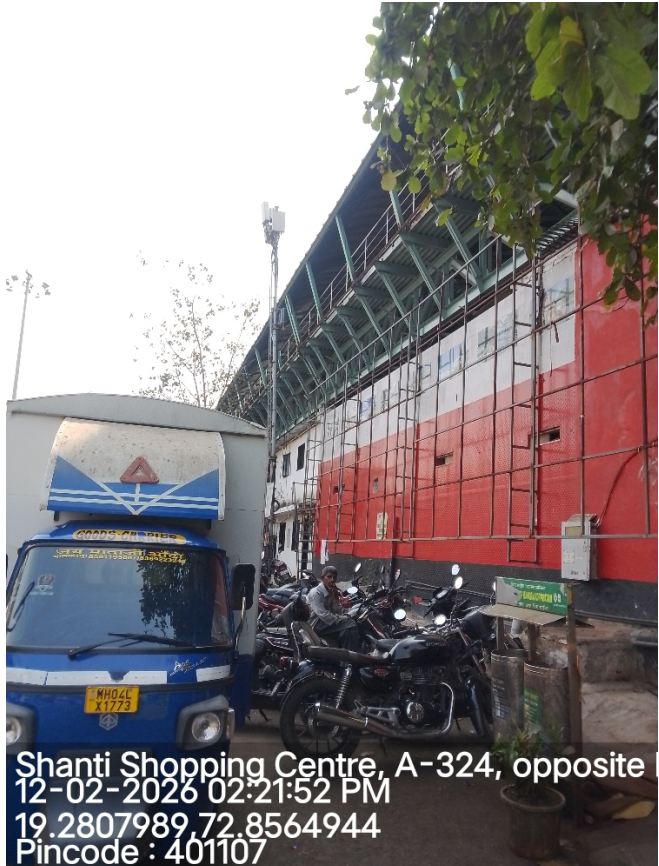
Shanti Shopping Centre, A-324, opposite 12-02-2026 02:21:52 PM 19.2807989, 72.8564944 Pincode : 401107

Shop inside with inventory photos establishing that the inside is of the same shop where the front photo was taken