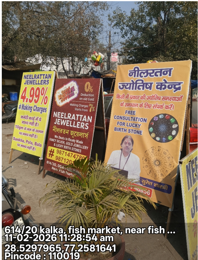
614/20 kalka, fish market, near fish ... 11-02-2026 11:28:54 am 28.5297965,77.2581641 Pincode : 110019

Shop inside with inventory photos establishing that the inside is of the same shop where the front photo was taken