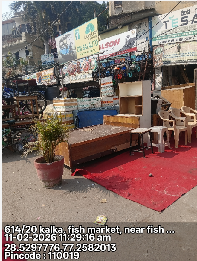
614/20 kalka, fish market, near fish ... 11-02-2026 11:29:16 am 28.5297776,77.2582013 Pincode : 110019

Shop front with horizontal view covering the left & right of the shop establishing if the shop is an individual structure, in a marketplace, highway, isolated place, in a cluster framework.