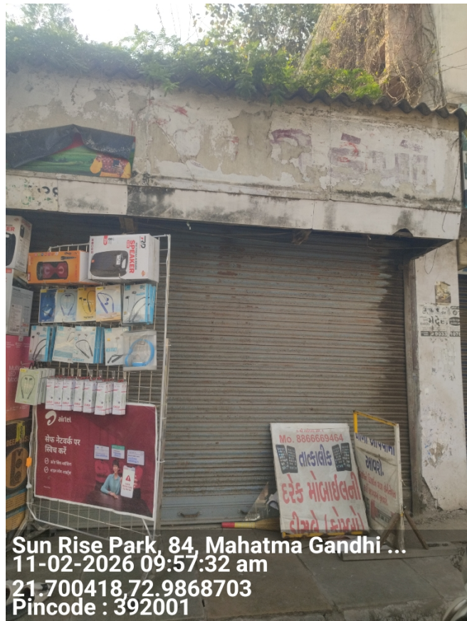
Sun Rise Park, 84, Mahatma Gandhi ... 11-02-2026 09:57:32 am 21.700418,72.9868703 Pincode : 392001

Shop front photo with full vertical viewpoint i.e; shop board, sealing, entrance, ground on which the shop is established (cemented, pilers, bricks, stands, mud, wheels etc.)