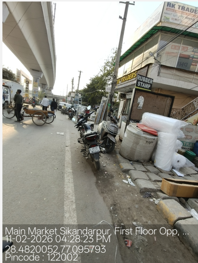
Main Market Sikandarpur, First Floor Opp, ... 11-02-2026 04:28:23 PM 28.4820052,77.095793 Pincode : 122002

Shop front with horizontal view covering the left & right of the shop establishing if the shop is an individual structure, in a marketplace, highway, isolated place, in a cluster framework.