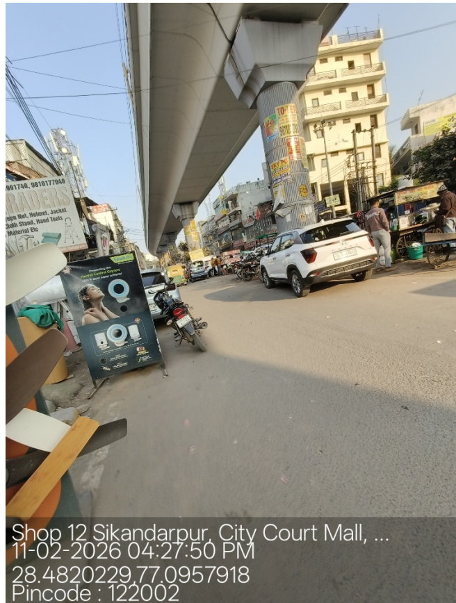
Shop 12 Sikandarpur, City Court Mall, ... 11-02-2026 04:27:50 PM 28.4820229,77.0957918 Pincode : 122002

Shop inside with inventory photos establishing that the inside is of the same shop where the front photo was taken