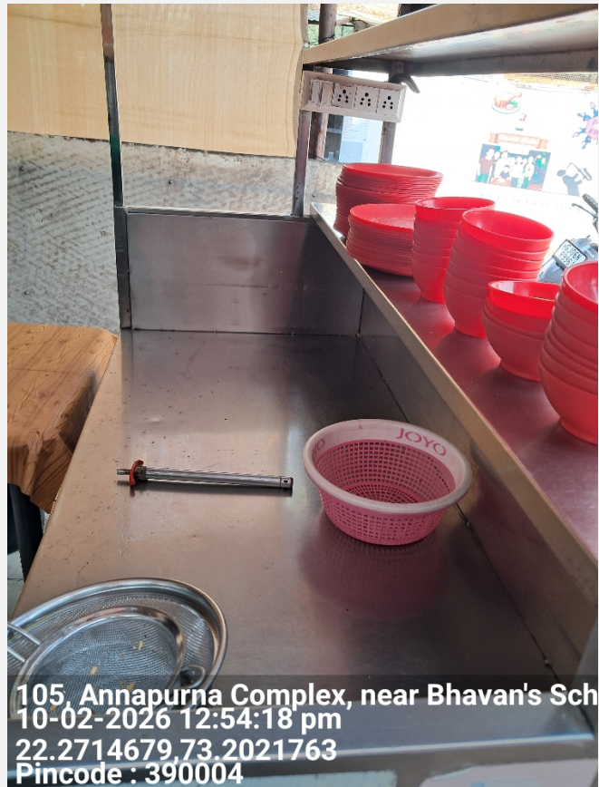
105, Annapurna Complex, near Bhavan's Sch 10-02-2026 12:54:18 pm 22.2714679,73.2021763 Pincode : 390004

Shop inside with inventory photos establishing that the inside is of the same shop where the front photo was taken