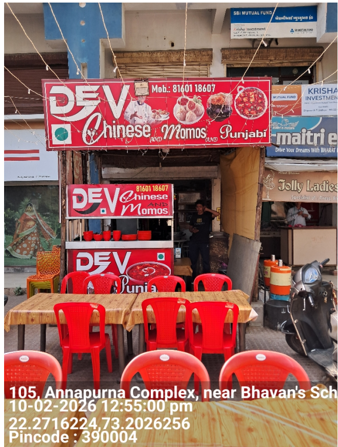
105, Annapurna Complex, near Bhavan's Sch 10-02-2026 12:55:00 pm 22.2716224,73.2026256 Pincode : 390004

Shop front with horizontal view covering the left & right of the shop establishing if the shop is an individual structure, in a marketplace, highway, isolated place, in a cluster framework.