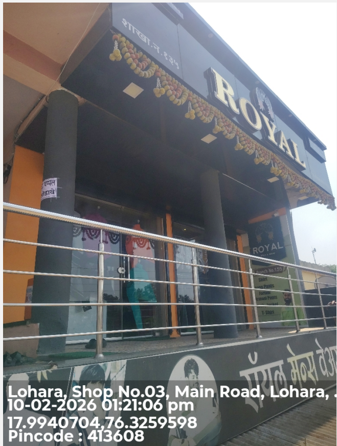
Lohara, Shop No.03, Main Road, Lohara, , 10-02-2026 01:21:06 pm 17.9940704,76.3259598 Pincode : 413608

Shop front photo with full vertical viewpoint i.e; shop board, sealing, entrance, ground on which the shop is established (cemented, pilers, bricks, stands, mud, wheels etc.)