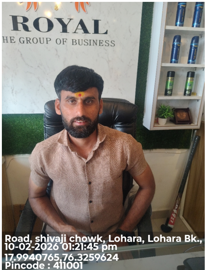
Road, shivaji chowk, Lohara, Lohara Bk., 10-02-2026 01:21:45 pm 17.9940765,76.3259624 Pincode : 411001

Take Photo of Person Met Inside the Shop