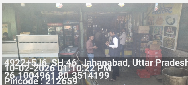
Shop Photo Outside