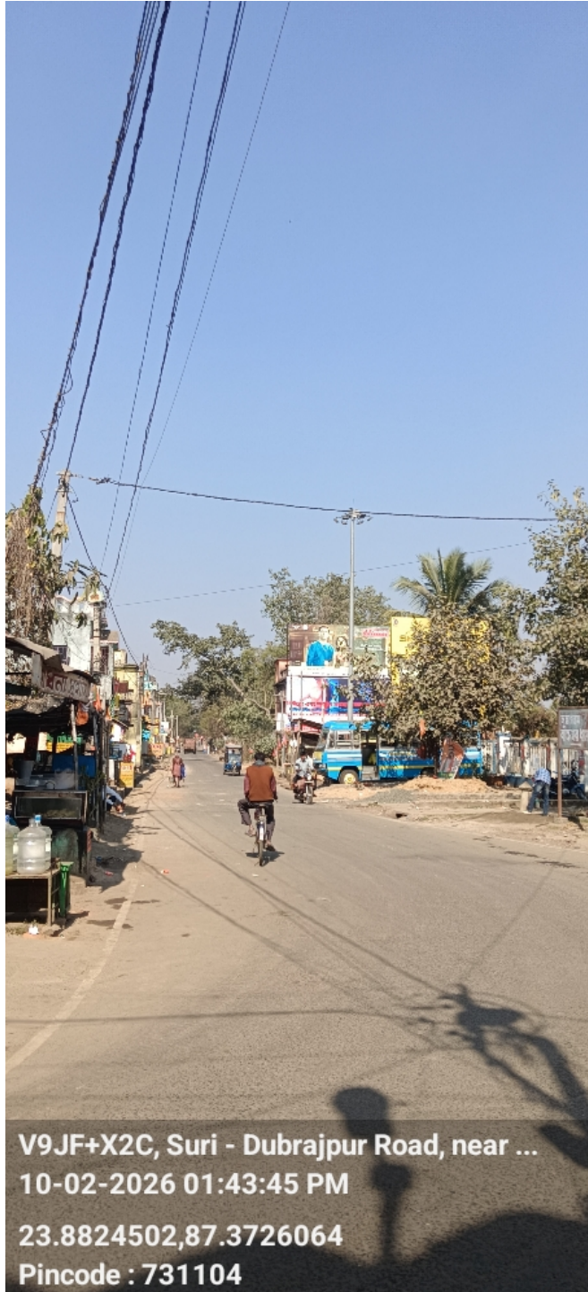
Photo with Agent