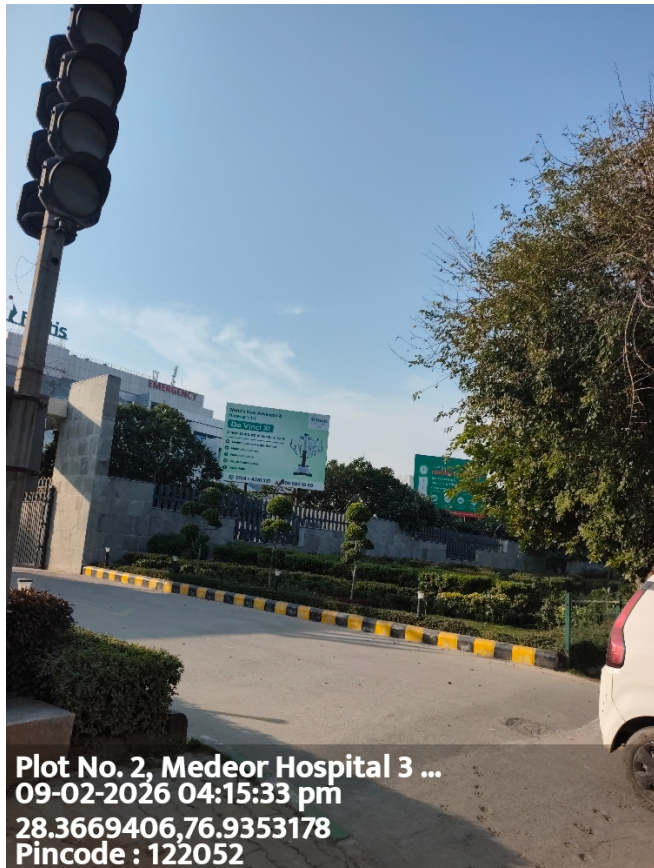
Plot No. 2, Medeor Hospital 3 ... 09-02-2026 04:15:33 pm 28.3669406,76.9353178 Pincode : 122052

Shop inside with inventory photos establishing that the inside is of the same shop where the front photo was taken