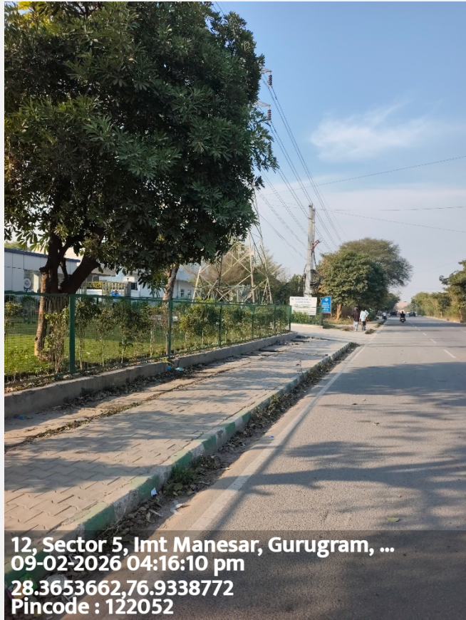
12, Sector 5, Imt Manesar, Gurugram, ... 09-02-2026 04:16:10 pm 28.3653662,76.9338772 Pincode : 122052

Shop front with horizontal view covering the left & right of the shop establishing if the shop is an individual structure, in a marketplace, highway, isolated place, in a cluster framework.