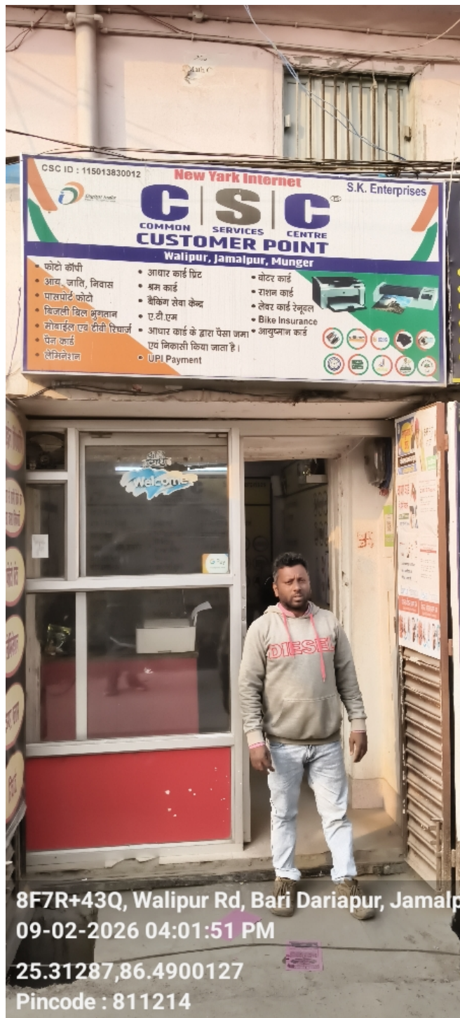
Shop Photo with Business Board