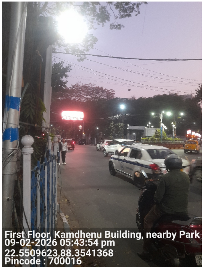
First Floor, Kamdhenu Building, nearby Park 09-02-2026 05:43:54 pm 22.5509623,88.3541368 Pincode : 700016