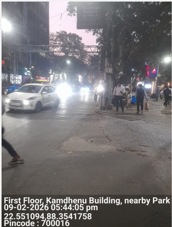
First Floor, Kamdhenu Building, nearby Park 09-02-2026 05:44:05 pm 22.551094,88.3541758 Pincode : 700016