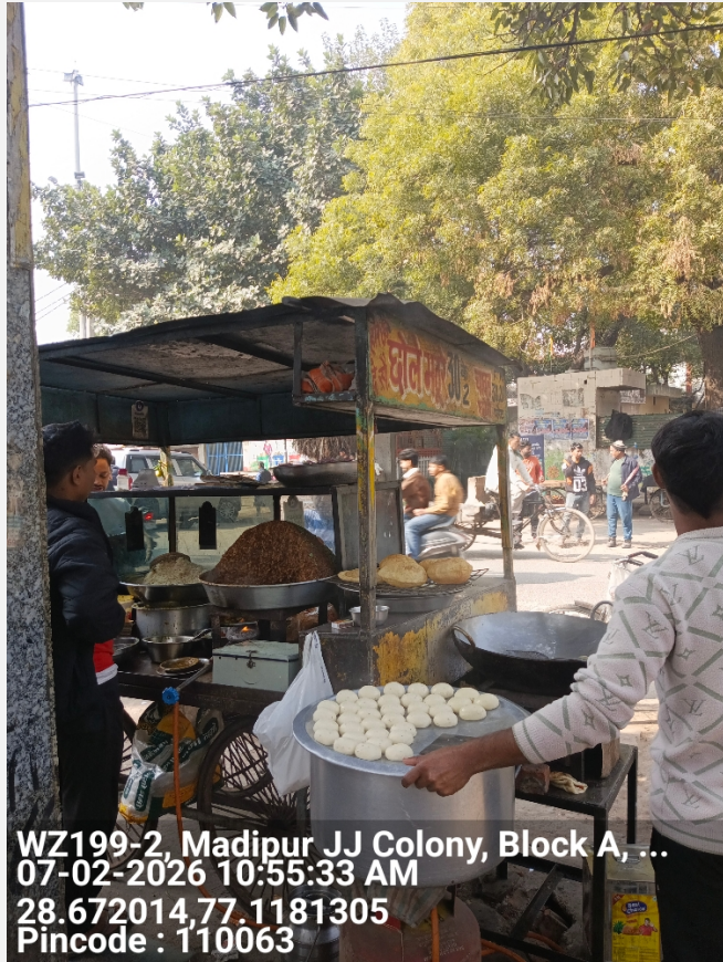
WZ199-2, Madipur JJ Colony, Block A, ... 07-02-2026 10:55:33 AM 28.672014,77.1181305 Pincode : 110063

Shop front with horizontal view covering the left & right of the shop establishing if the shop is an individual structure, in a marketplace, highway, isolated place, in a cluster framework.