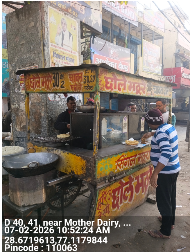
D 40, 41, near Mother Dairy, ... 07-02-2026 10:52:24 AM 28.6719613,77.1179844 Pincode : 110063

Shop inside with inventory photos establishing that the inside is of the same shop where the front photo was taken