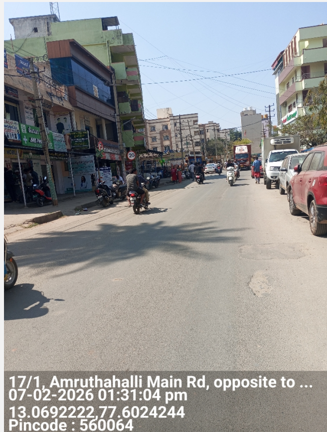
17/1, Amruthahalli Main Rd, opposite to ... 07-02-2026 01:31:04 pm 13.0692222,77.6024244 Pincode : 560064

Take Photo of Person Met Inside the Shop