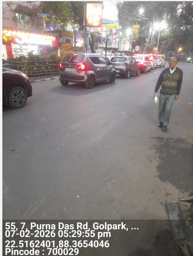
55, 7, Purna Das Rd, Golpark, ... 07-02-2026 05:29:55 pm 22.5162401,88.3654046 Pincode : 700029

Take Photo of Person Met Inside the Shop