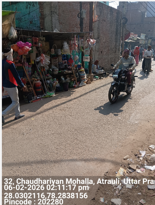
32, Chaudhariyan Mohalla, Atrauli, Uttar Pradesh 06-02-2026 02:11:17 pm 28.0302116,78.2838156 Pincode : 202280

Take Photo of Person Met Inside the Shop