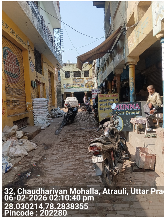
32, Chaudhariyan Mohalla, Atrauli, Uttar Pradesh 06-02-2026 02:10:40 pm 28.030214,78.2838355 Pincode : 202280

Shop front photo with full vertical viewpoint i.e; shop board, sealing, entrance, ground on which the shop is established (cemented, pilers, bricks, stands, mud, wheels etc.)