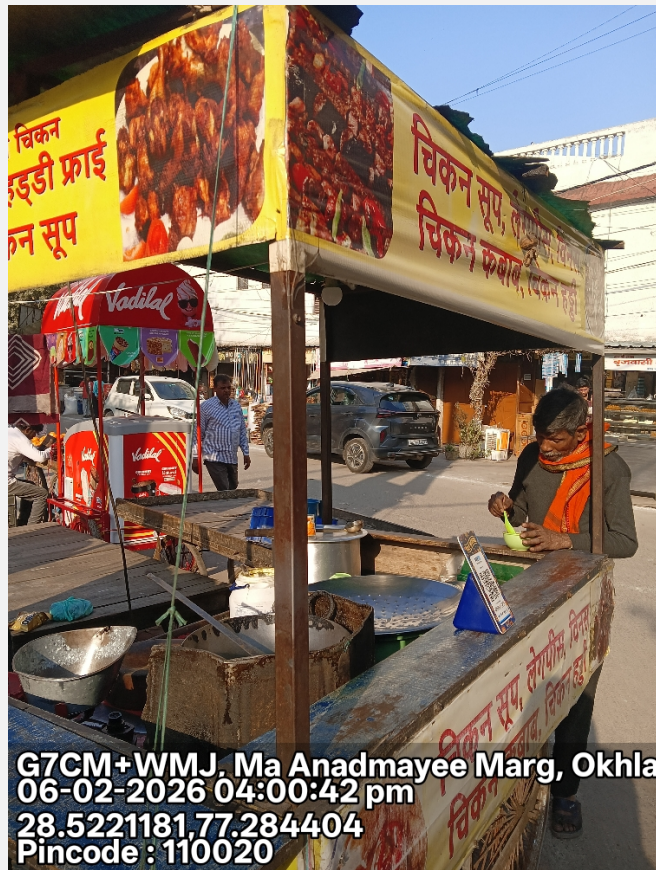
G7CM+WMJ, Ma Anadmayee Marg, Okhla 06-02-2026 04:00:42 pm 28.5221181,77.284404 Pincode : 110020

Shop front with horizontal view covering the left & right of the shop establishing if the shop is an individual structure, in a marketplace, highway, isolated place, in a cluster framework.