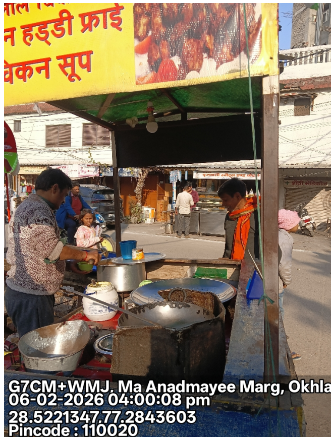
G7CM+WMJ, Ma Anadmayee Marg, Okhla 06-02-2026 04:00:08 pm 28.5221347,77.2843603 Pincode : 110020

Shop inside with inventory photos establishing that the inside is of the same shop where the front photo was taken