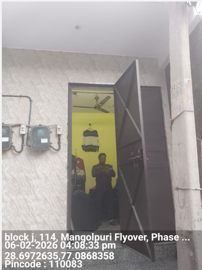
block j, 114, Mangolpuri Flyover, Phase ... 06-02-2026 04:08:33 pm 28.6972635,77.0868358 Pincode : 110083

Shop front with horizontal view covering the left & right of the shop establishing if the shop is an individual structure, in a marketplace, highway, isolated place, in a cluster framework.