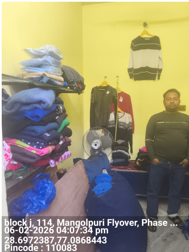
block j, 114, Mangolpuri Flyover, Phase ... 06-02-2026 04:07:34 pm 28.6972387,77.0868443 Pincode : 110083

Shop inside with inventory photos establishing that the inside is of the same shop where the front photo was taken