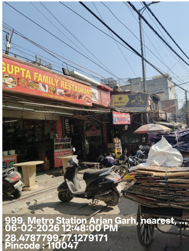
999, Metro Station Arjan Garh, nearest, ... 06-02-2026 12:48:00 PM 28.4787799,77.1279171 Pincode : 110047

Shop front with horizontal view covering the left & right of the shop establishing if the shop is an individual structure, in a marketplace, highway, isolated place, in a cluster framework.