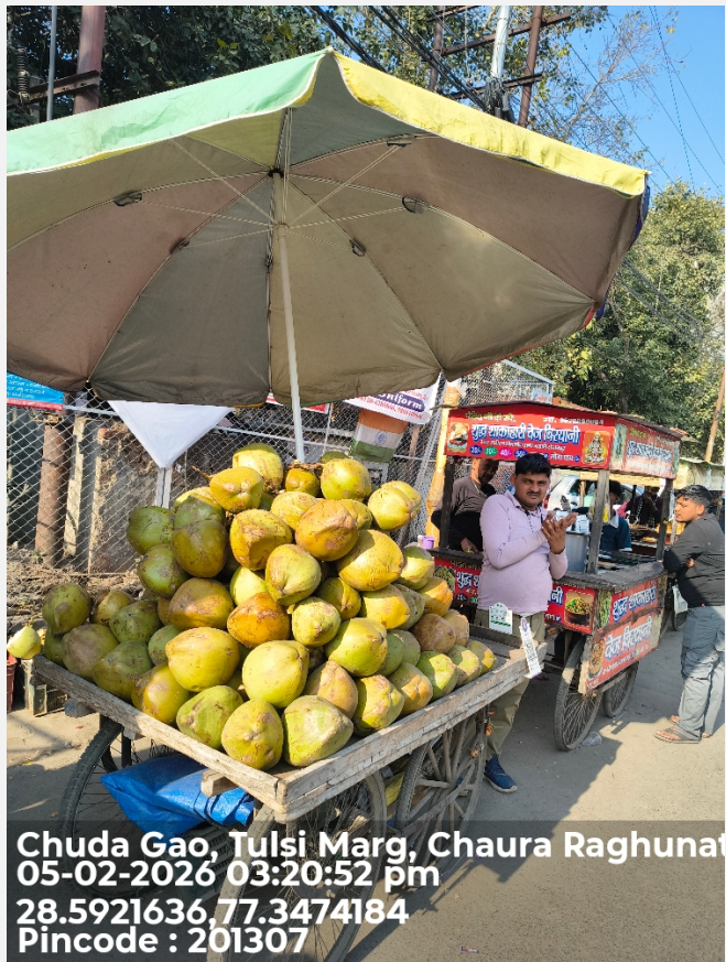
Chuda Gao, Tulsi Marg, Chaura Raghunath 05-02-2026 03:20:52 pm 28.5921636,77.3474184 Pincode : 201307

Shop inside with inventory photos establishing that the inside is of the same shop where the front photo was taken