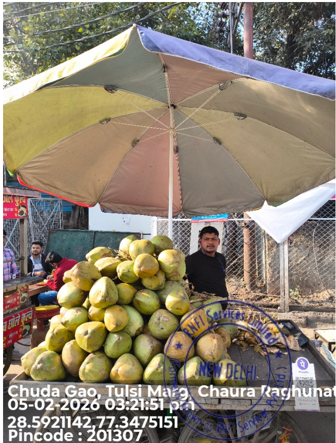
Chuda Gao, Tulsi Marg, Chaura Raghunath 05-02-2026 03:21:51 pm 28.5921142,77.3475151 Pincode : 201307