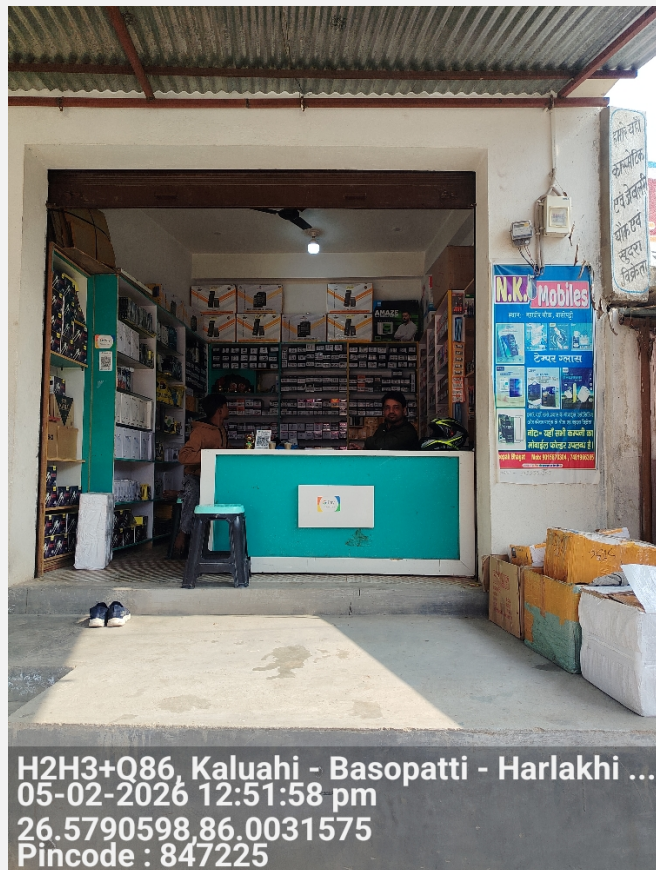
Shop Photo Outside

H2H3+Q86, Kaluahi - Basopatti - Harlakhi ... 05-02-2026 12:51:58 pm 26.5790598,86.0031575 Pincode : 847225