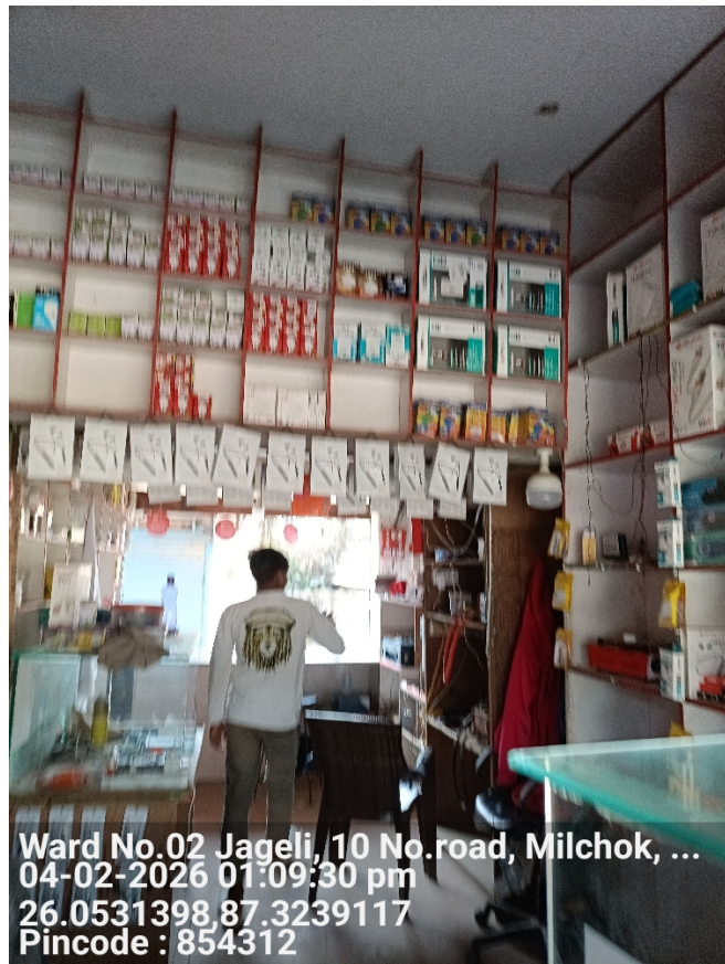
Photo of Machinery Setup