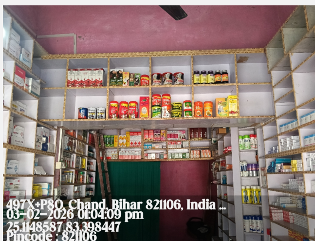
Photo of Stock

497X+P8Q, Chand, Bihar 821106, India ... 03-02-2026 01:04:09 pm 25.1148587,83.398447 Pincode : 821106